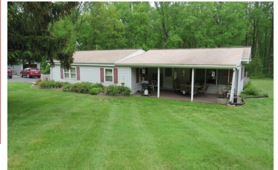
Information is deemed correct but not guaranteed.