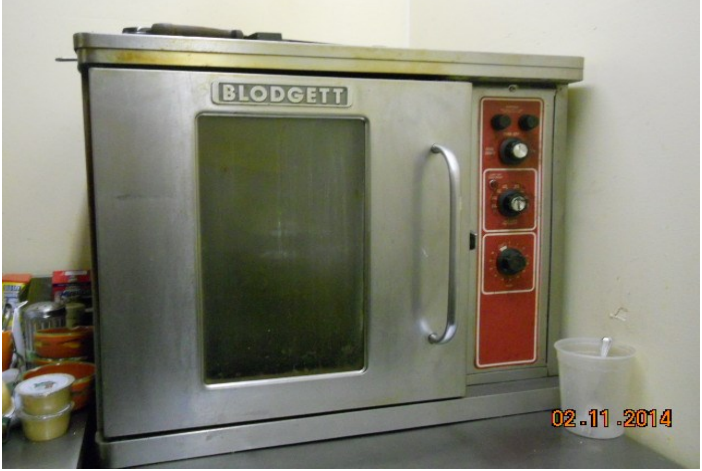
To see more photos of equipment, please visit our website at www.HorningFarmAgency.com

3 bay bakers sink (extra large bowls about 20x20x10) ss; 3 bay bar sink ss; Single door convection oven with table; 3 bay electric steam table wet or dry with sneeze guard, cutting board; 24 inch charbrolier; Meadowcreek smoker; 8' dunnage table; 7.5' prep table with hand washing sink and cabinet ss; Ice bin with shelves; 4.5' stand alone freezer; 3' floor freezer; Beveragair cooler; 4 microwaves; Whirlpool Refrigerator with top freezer; 10'awning maroon in color; Portable air conditioner; Vanity with sink; 9 bar stools black 17"; 18 stackable outside chairs; 5'ft ss prep table; 6 burner gas stove with stand; Misc. framed pictures; 2 rolling carts; Manicure table; Large vine wreath; 3'prep table with cutting board top; Misc wooden chairs; Fatigue mats; Misc. plates, cups, bowls, saucers; Southern Living @ Home Décor sconces, vases; Misc box lot items; Tec cash register; Ss carving station; Corrugated metal sheets; 1 round table (wooden); 1 2x2 wooden table; Misc food trays, baskets; and much more!