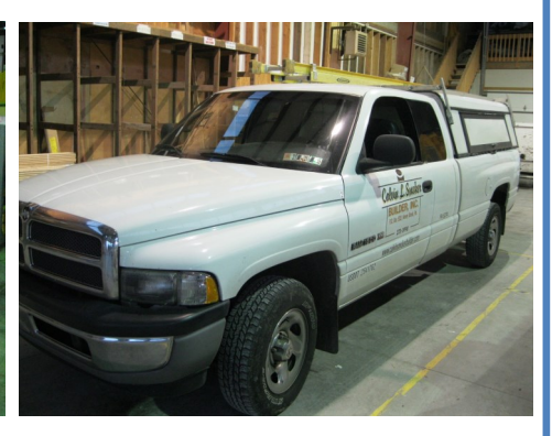
To see more photos of equipment, please visit our website at www.HorningFarmAgency.com